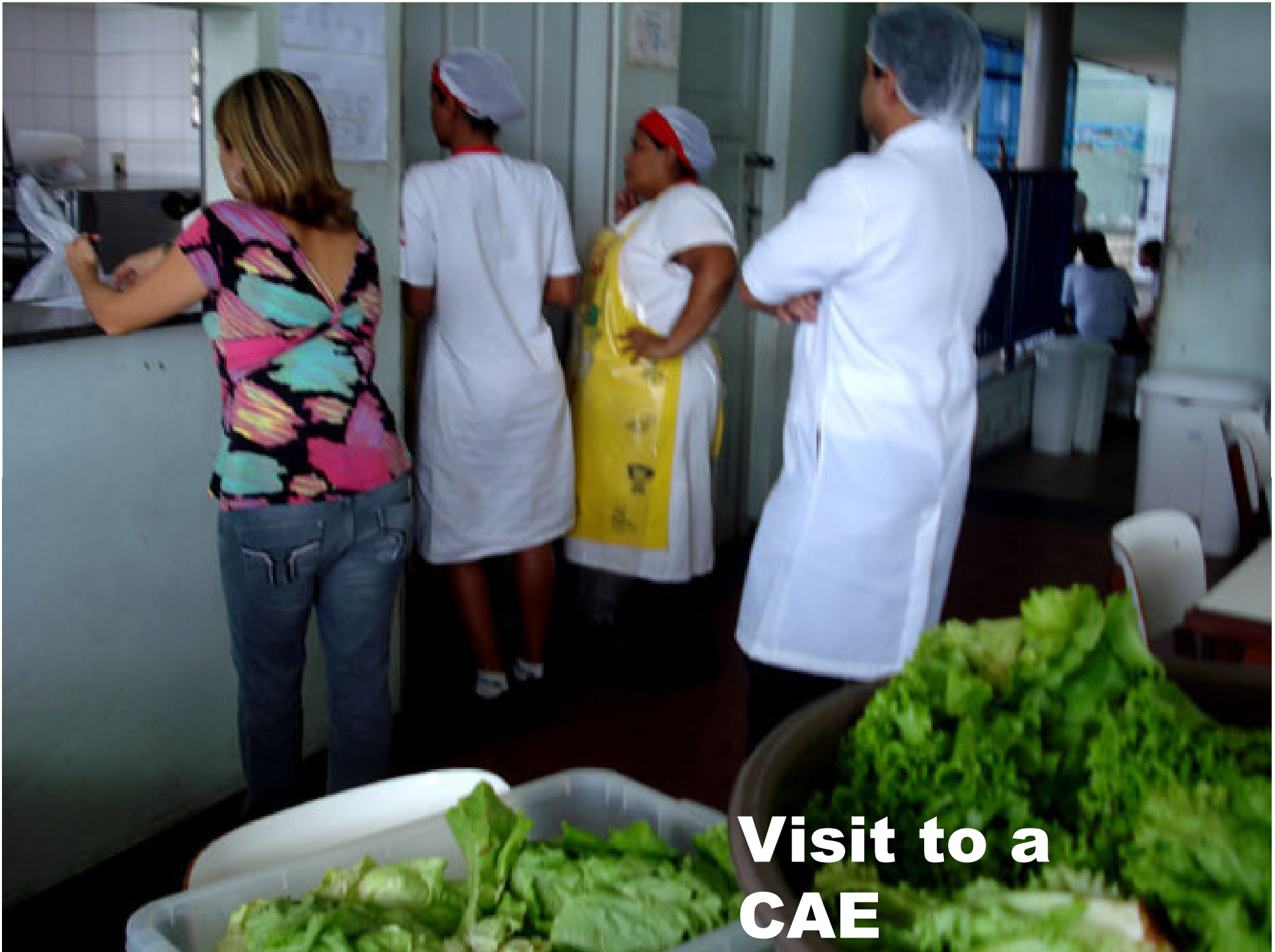
Visit to a CAE